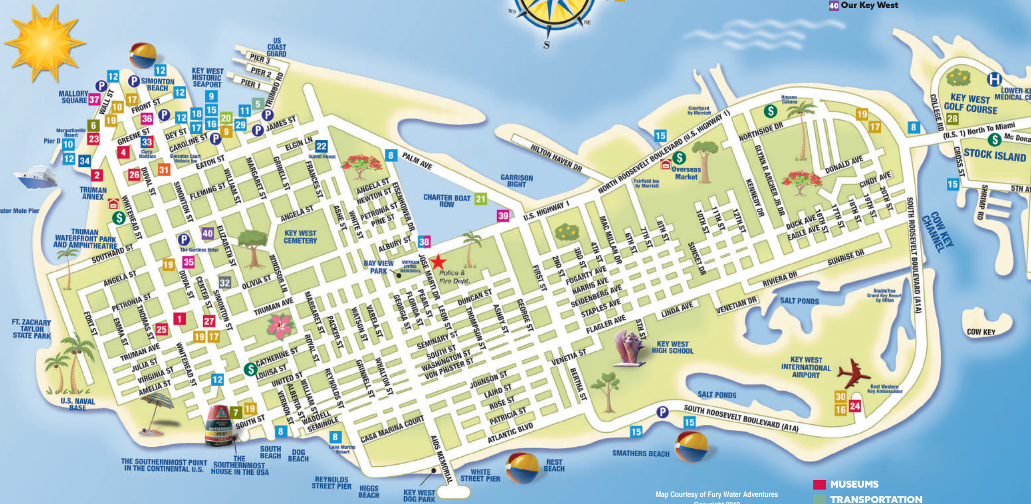
Map Courtesy of Fury Water Adventures Copyright 2019